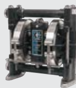
Husky™ 307 3/8 inch Pump